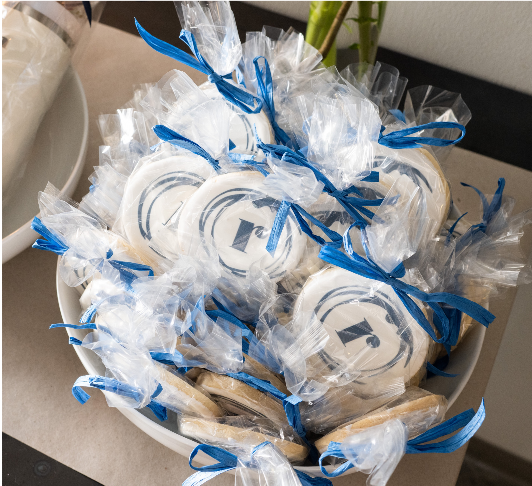
Custom Logo Sugar Cookies