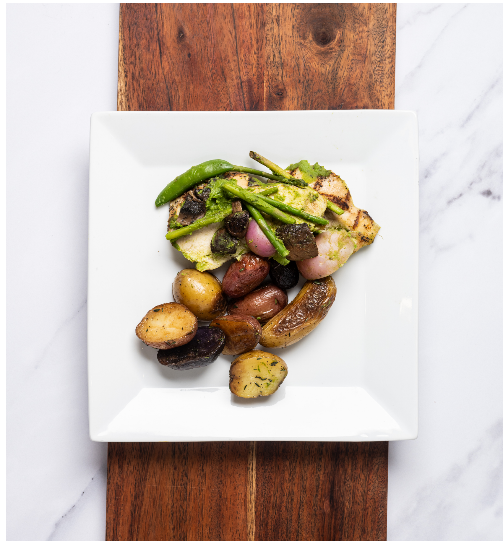
Roasted Chicken with Spring Vegetables