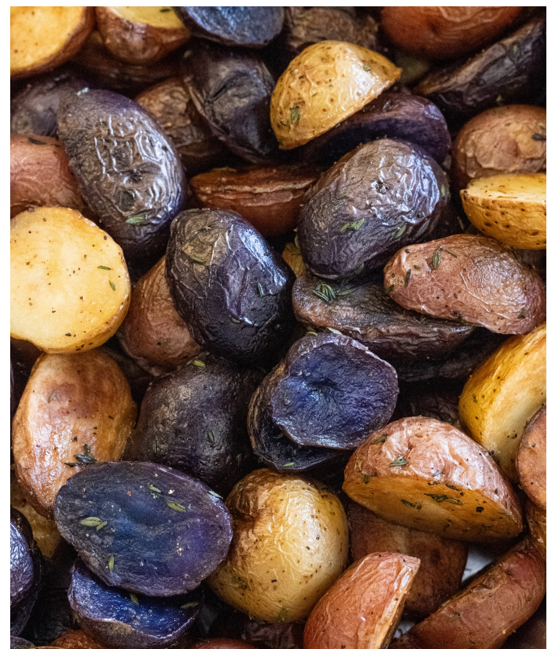
Roasted Heirloom Baby Potatoes