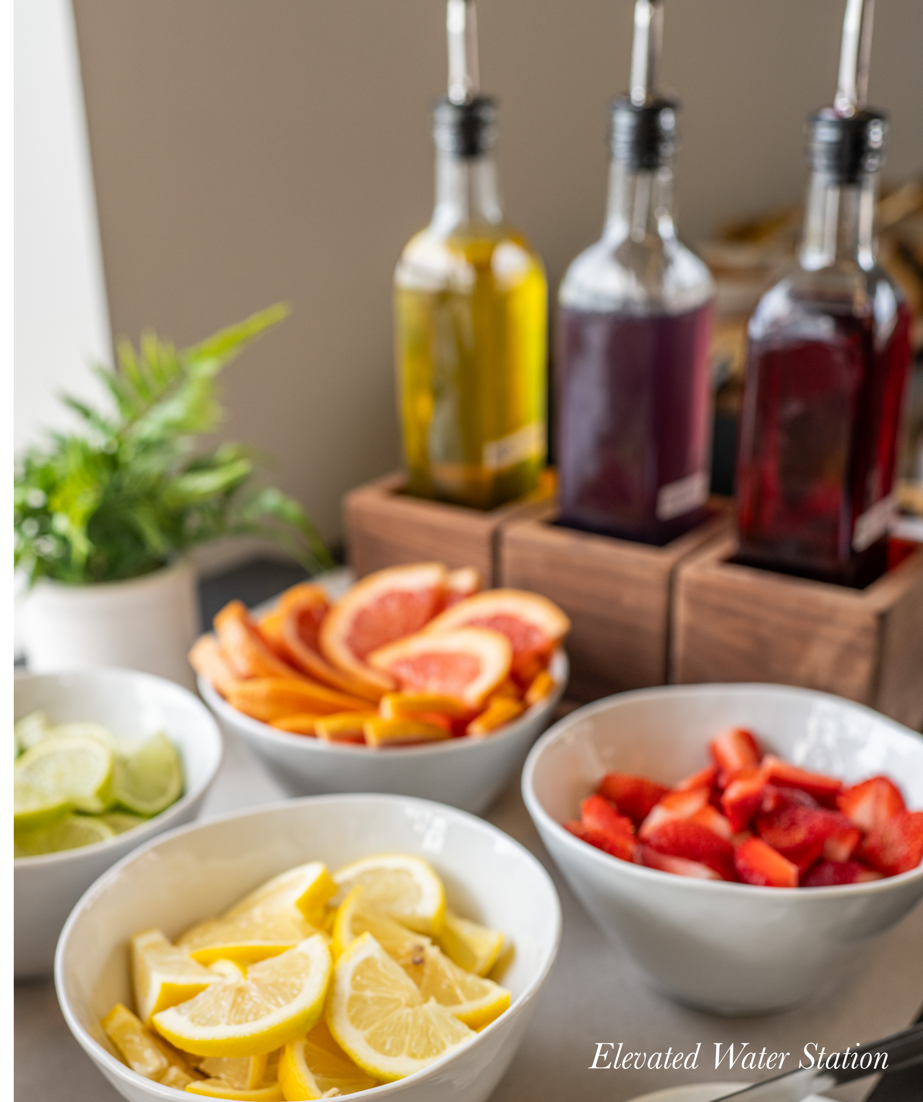
Elevated Water Station

Make hydration fun and flavorful with an Elevated Water Station. Enjoy chilled and sparkling water paired with fresh cut fruit, flavored syrups, and hand-cut herbs.