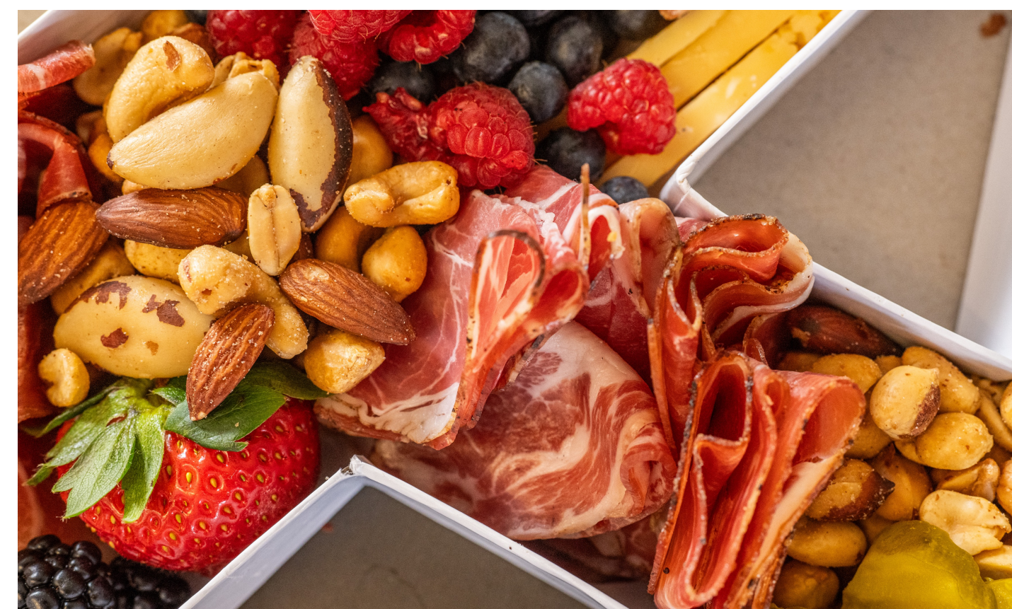
Cheese and Charcuterie with Custom Letter Trays