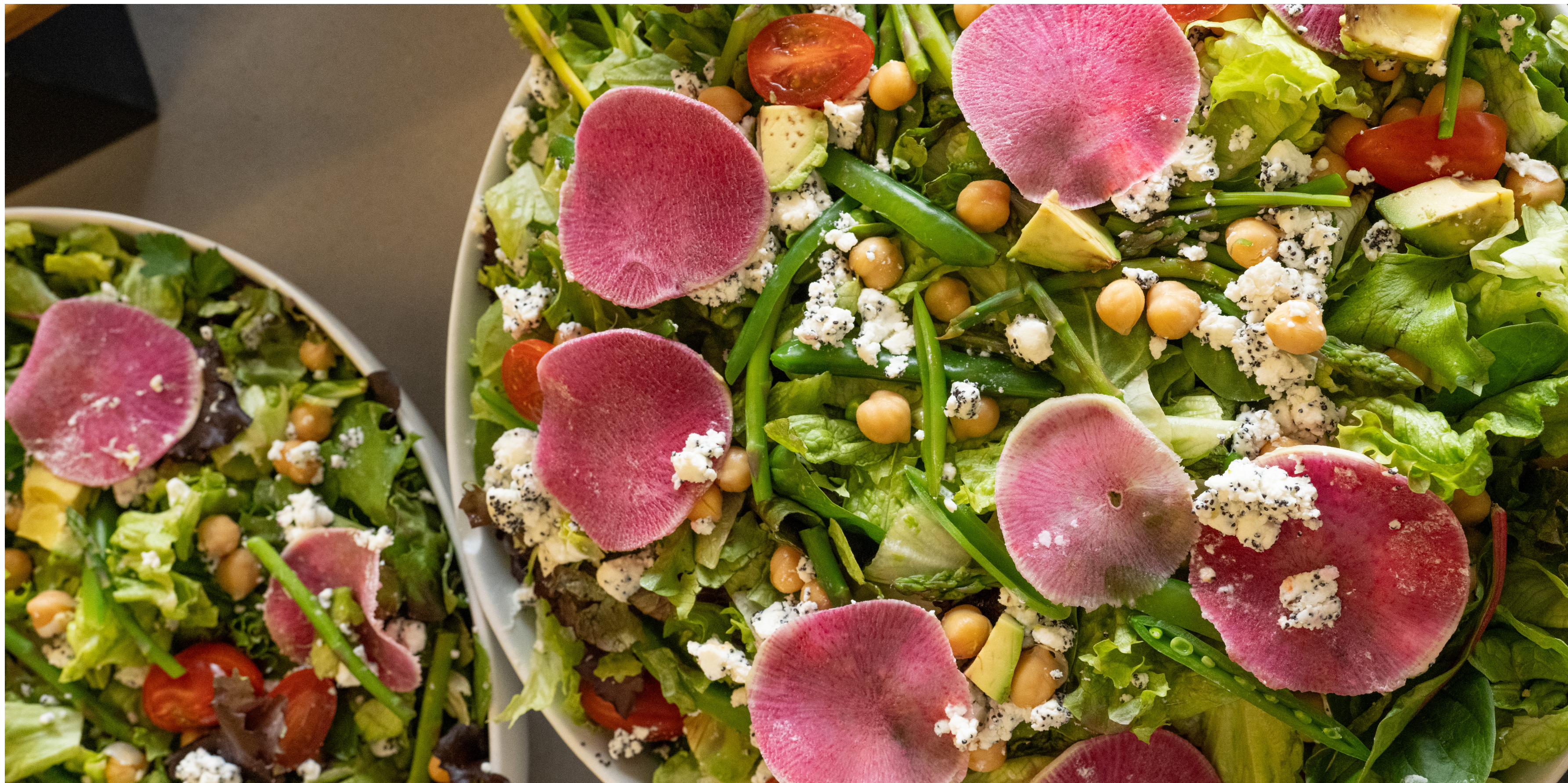
Vibrant Spring Salad