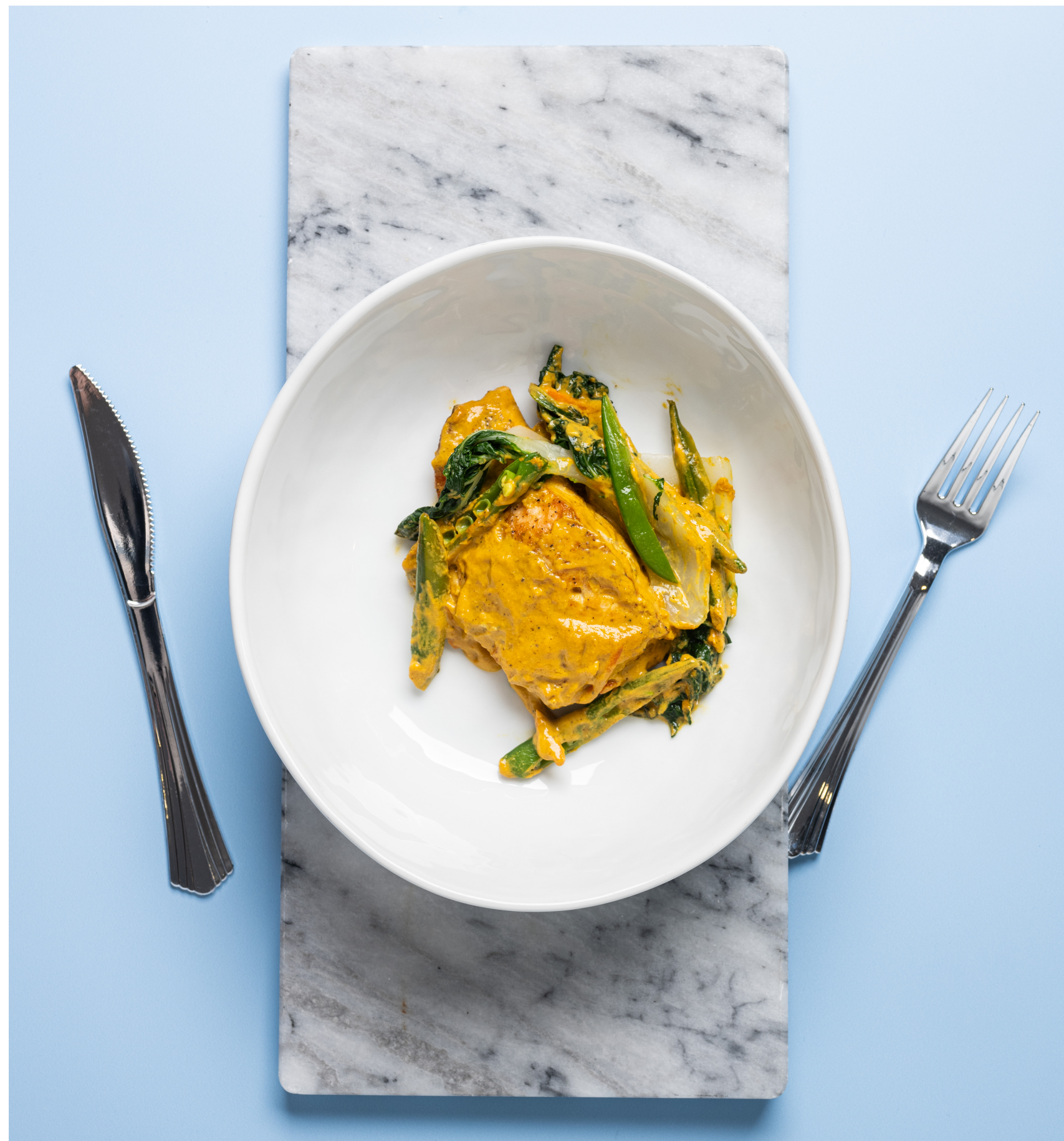
Salmon with Ginger Coconut Curry