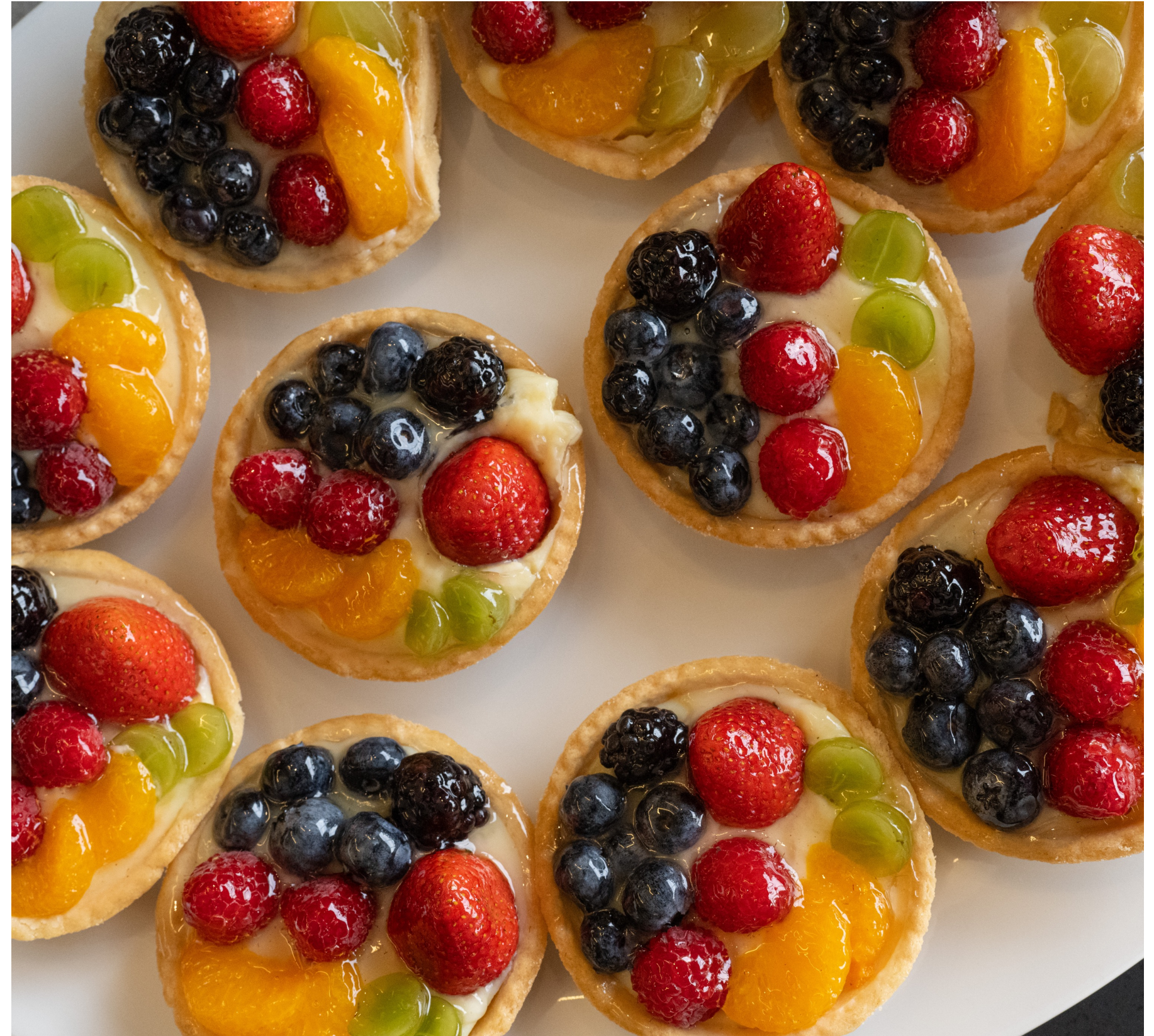
Fresh Fruit Tart