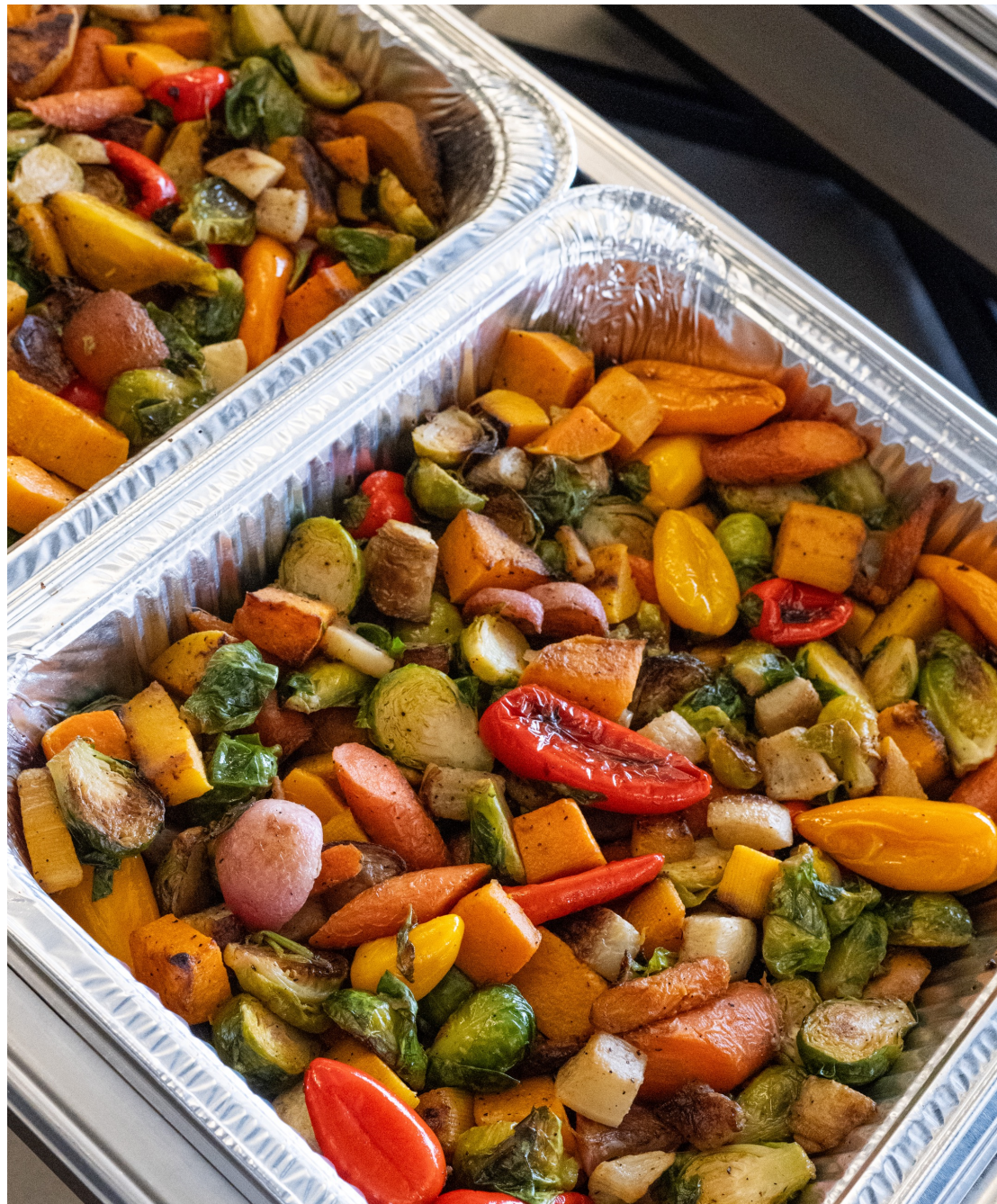
Roasted Colorful Vegetables